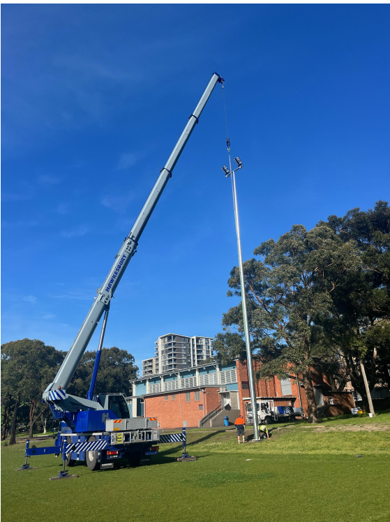
EXAMPLE OF LIGHTING INSTALLED