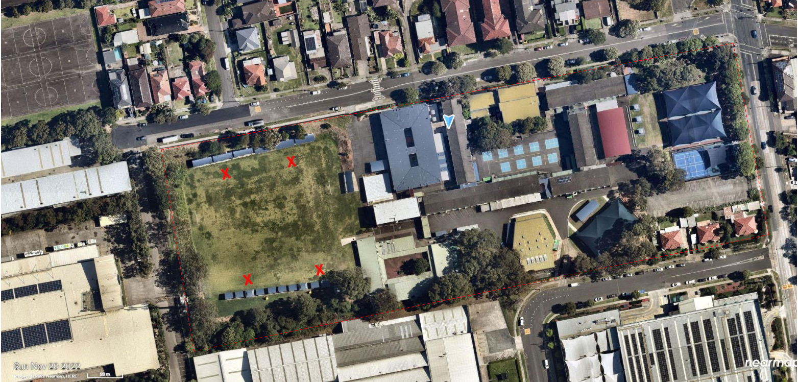
LOCATION PLAN NOT TO SCALE